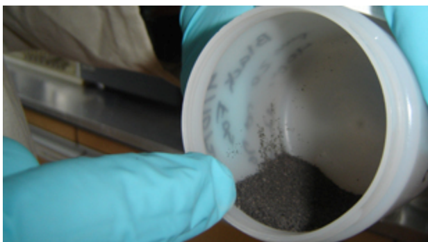
After being separated from other types of apatite, the black apatite was ground into a fine dust.

I started by sorting out the black apatite rocks from the other apatite sediments and grinding them down to a specific size (20 mesh to 70 mesh, or 1 mm to 0.2 mm). I then activated the ground apatite using heat along with water, air, and/or nitrogen. I determined the best activation method by trying these different methods and then testing the activated materials' abilities to adsorb zinc and arsenic. I discovered that the best activation method was heating the rock to 400°C in a nitrogen atmosphere. The heat and the inert nitrogen atmosphere with no oxygen present changed the chemistry of the apatite's surface, allowing it to more easily adsorb the contaminants.