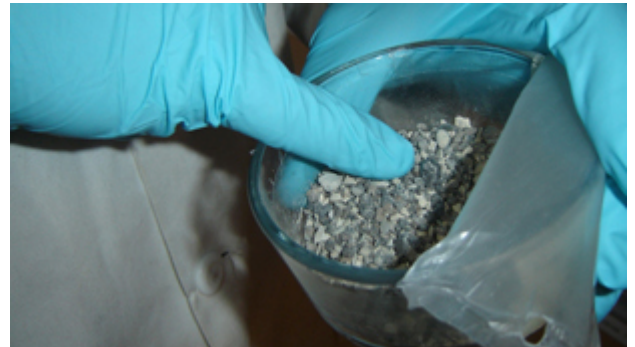
The author points to small pieces of black apatite he had to sort out from the raw material.

Apatite comes in a variety of forms but is most often a sandy grey color with a low carbon content. The raw material I used was a black apatite rock with relatively high carbon content. The black color is indicative of higher carbon levels. Bradley Crannell collected the raw material from a phosphate mining operation in North Carolina. One of the advantages of using black apatite is that it is a by-product of mining and therefore a free, recyclable material.