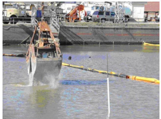
Capping in the Anacostia River in Washington D.C.

Capping is an in-situ treatment in which the contaminated area is covered with a layer of material such as sand or earth. Large barges or crane ships navigate to the site carrying large amounts of the capping material and pour the substance into the water right on top of the contaminated sediment. This blankets the sediment with a clean surface for plants and animals to use. While this method may slow the contamination’s upward flow, it does not treat the issue; it only temporarily masks it. The contamination remains in the ground and can still harm the water and soil around the capping site.