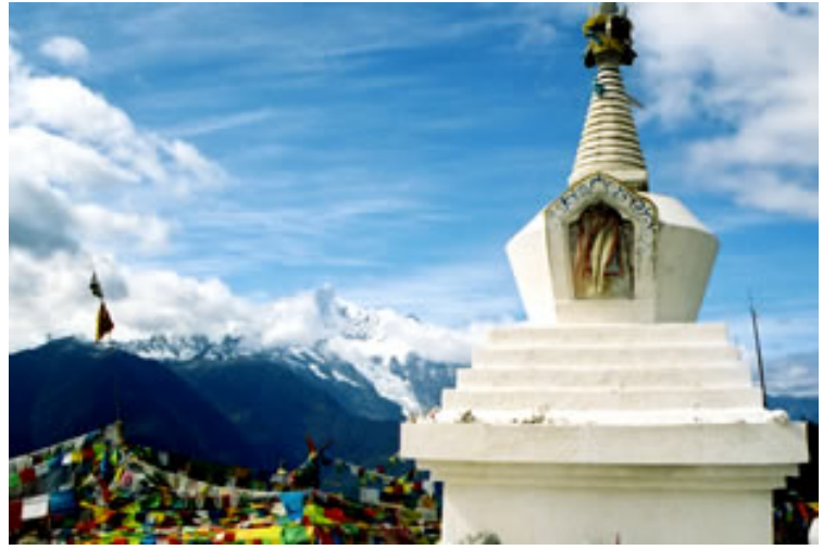
Fig. 4 - Buddhist stupa, a spiritual monument, with Kawa Karpo in the background

As a néri , Kawa Karpo is one of the most important pan-Tibetan Buddhist sacred sites, making it a very important pilgrimage site. Every autumn to early winter, thousands of pilgrims from all over cultural Tibet travel to Kawa Karpo to show respect for the deity. Kawa Karpo holds specific importance not only in the entire Tibetan worldview, but also in how the local Tibetans conceptualize their landscape. The snowy mountains of Kawa Karpo and his followers dominate the Deqin landscape as a physical representation of the deity and his power. The locals are aware of this supernatural presence, and they understand that, in their everyday lives, they must maintain a good relationship with the spirits that inhabit their world, especially Kawa Karpo. Their belief in Kawa Karpo, and the importance they place on him in the ritual cosmos, have greatly shaped how they perceive the increasing number of outside visitors and changing socio-economic realities.