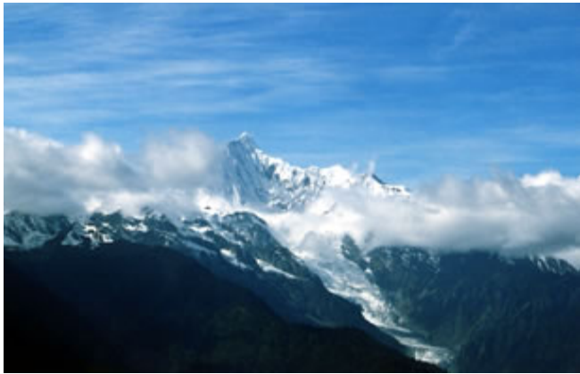
Fig. 2 - Kawa Karpo, 6,740 meters (22,107 feet), one of the eight guardian deities of Tibetan Buddhism

Despite the risk of angering the deities, religious authorities realized that humans could not survive without some sort of land exploitation and building. Thus, the rigua , or “sealing the mountain,” line was developed: a physical boundary between the human-inhabited lands and the spirit world, maintained by lamas and enforced