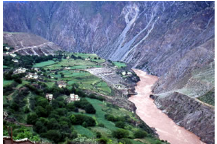
Fig. 1 – The Xidang village

My methodology incorporated anthropological fieldwork and research of previous scholarship. I placed paramount importance on gaining an understanding of the specific beliefs and stories of the Deqin Tibetans, through informal interviews and observation while living with families in the villages of Yubeng, Xidang, Mingyong, and the town of Deqin. (Fig. 1) I was unable to arrange a translator, so all my communication with the locals was in Chinese (Mandarin, the official language of China), which made some conversations very difficult, but not impossible. At times, visiting Chinese tourists would assist in conversation, their more standard Mandarin making things easier. I also interviewed members of The Nature Conservancy, a non-governmental organization doing work in the area, and relied on secondary accounts from journal articles, monographs, and